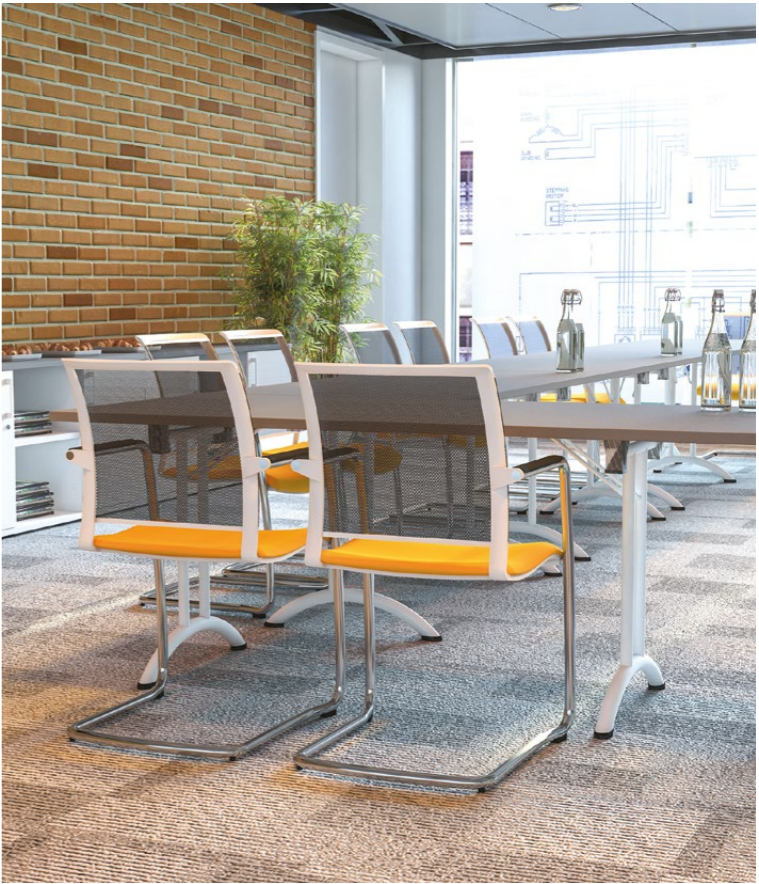
Ideal for flexible meeting rooms, Folding Leg Tables can be easily reconfigured and stored away due to their compact folding leg design.