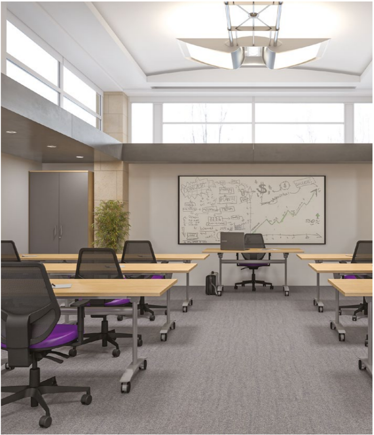
Tilt Top Tables are available in 800mm & 600mm depths in various shapes offering flexibility when creating configurations